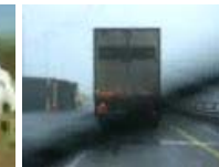
Wind blows truck over on bridge during recent stor..