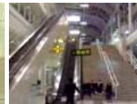
Nude escalator slide goes wrong..