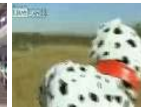
Puppy gets his revenge on the marine..