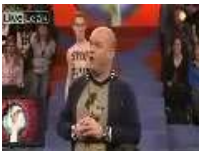
Streaker gets completely OWNED on Dutch TV..