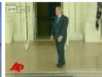
Raw Video: Bush tap dances March 05/08..