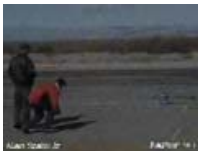
the best and most extreme r/c pilot ever.. a must..