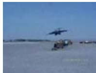
Boeing C-17 Bounces off Runway..